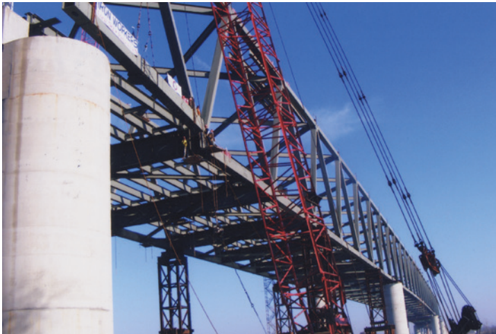
C.J. Mahan Construction at US 60 Ledbetter Bridge