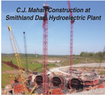
C.J. Mahan Construction at Smithland Dam Hydroelectric Plant

As always, if we can be of any help to any member, please call our office at (270) 443-7766. We will gladly assist you in any way we can. ♦