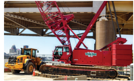
Walsh drilling at the Louisville Downtown Bridge project.