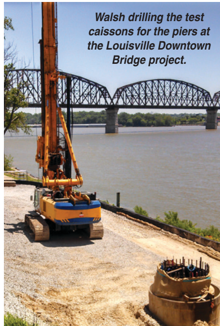
Walsh drilling the test caissons for the piers at the Louisville Downtown Bridge project.

In closing, we want to thank our members for regularly attending our monthly meetings, whether it is in Louisville or Elrod, Indiana. Also, please check to see that your drug card and certifications are current. ♦