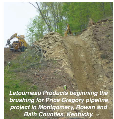
Letourneau Products beginning the brushing for Price Gregory pipeline project in Montgomery, Rowan and Bath Counties, Kentucky.

At this time, work on the Marathon Pipeline from Mount Sterling to Morehead is getting ready to start. Letourneau has the brushing and should use around 20 operators. Price Gregory has the mainline and should use around 100 operators, with this project lasting until late fall. We are also expecting to pick up more pipeline work this summer.