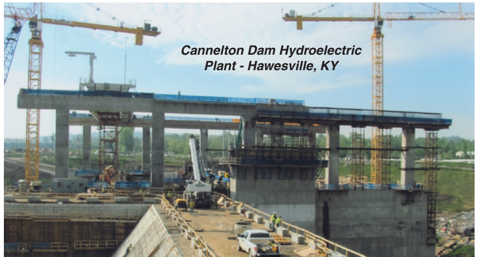
Cannelton Dam Hydroelectric Plant - Hawesville, KY

Work has slowed down in the Bowling Green area. We had a good outage this past winter at the G.M. Corvette Plant with a good number of NCCCO operators on two shifts. It is reported that this summer there may be another small outage at the plant. Whittenberg Construction is the General contractor at Western Kentucky University with Shain Steel and Frontier Enterprises as the sub contractors.