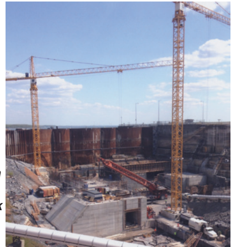
Thalle Construction Co. at the KY Dam Lock addition