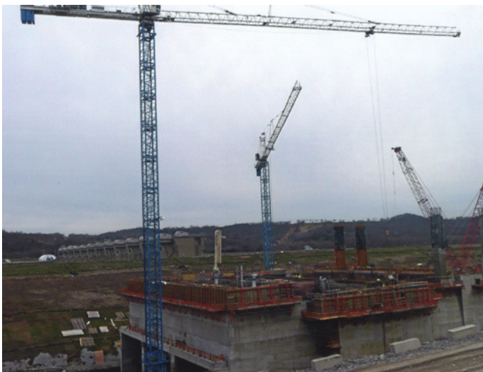
Work continues on Meldahl Dam Hydroelectric Plant in Foster, KY

Please call our office at 859-278-8458 if we can be of any assistance. ♦