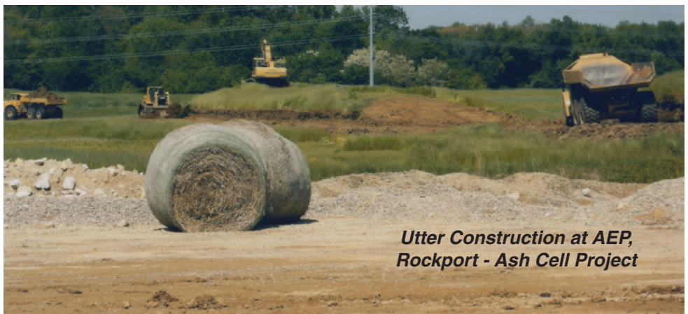
Utter Construction at AEP, Rockport - Ash Cell Project

State Group is doing maintenance and outage work at AGC with two operators. Sterling Boiler is picking up more maintenance work at AGC with three operators and has been doing outage work at A.B. Brown Power Plant with two to three operators this winter.