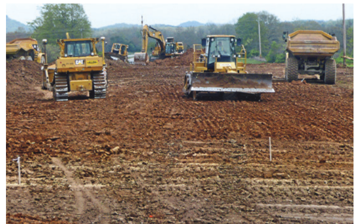
Allen Co. builds new ramps on Mountain Parkway